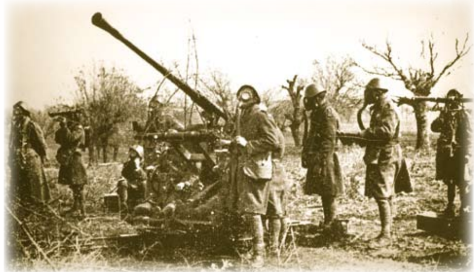
EXPECTING A CHEMICAL ATTACK

Louis de Bernières was born in London. His fourth novel, Captain Corelli's Mandolin , won the Commonwealth Writers' Prize and was translated into more than 30 languages. His latest novel is A Partisan's Daughter .