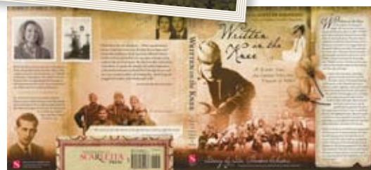
COVER WITH FLAPS